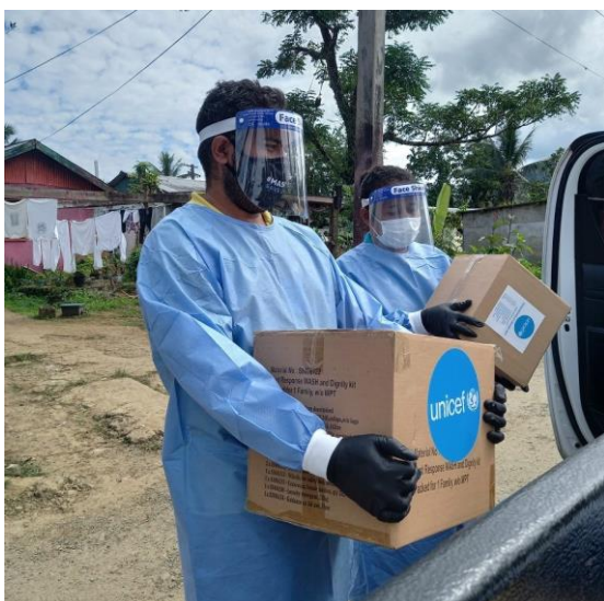
Figure 1: UNICEF supported MoHMS surge support team delivering WASH kits to Tacirua Settlement

Distribution was physically distanced where distribution teams were dispatched with kits in full personal protective equipment (PPE). The kits were left at the edge of a home and the beneficiary collected the items after the team was at a safe distance.