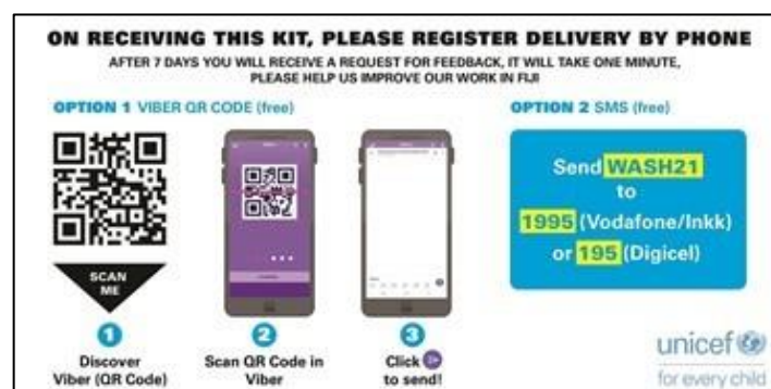
Figure 2: Instruction label affixed to WASH kit

The feedback system was developed after the first tranche of kits were delivered, as the acute need for kits was present. Over 4,000 kits with the instruction labels on how to access the survey were distributed, of which 650 respondents initially registered and 330 completed the survey between August and November 2021. The 8% response rate can be considered very good producing a sample size similar or larger than otherwise possible. The sample however is limited by the self-selection of respondents, through which it was not possible to ensure that all ages, genders and vulnerable groups were represented. In general, kits contained supplies for all household members, but only one respondent answered from each. It is difficult to ascertain if the respondents are skewed towards a particular family member. These limitations were noted and accepted given the time-sensitive distribution plan.