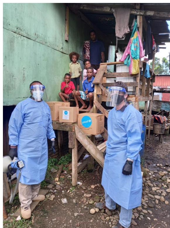
Figure 5: UNICEF and MoHMS teams delivering WASH kits to Qauia Settlement

Respondents were asked if they wished to proceed with the survey, a number of which didn't reply with exactly "OK" and were not surveyed. This highlights the importance of how the RapidPro campaign is initially set up.