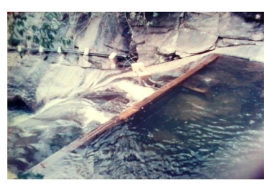
Figure 4: A Weir Intake used in a Rural Water Supply System

Usually, intakes constructed in streams frequently requires the construction of small diversion dams. In this manner, provisions can always be made for a sufficient depth of water above the intake pipe, for the settling of suspended reducing matter, thereby the turbidity of the water, and for keeping floating leaves and other debris from obstructing the intake structure. As a result of climate change, many streams are now experiencing heavy silt loads during season with very high rainv precipitation events and very low flows during dry season due to very low retention capabilities in the catchment. Therefore. it is essential that the intake has to be designed to cater to this variability improving it's resilience during floods as well as dry weather.