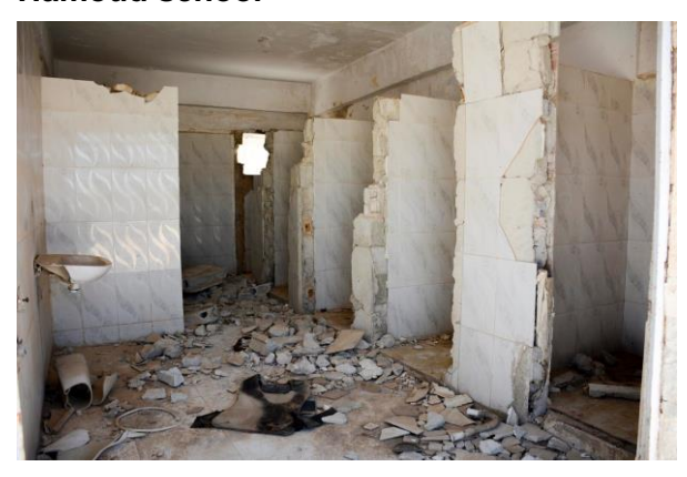
Figure 5. Damaged toilets at Reyad Hamoud school

UNICEF and partners in the WASH sector are restoring and rehabilitating school infrastructure, including WASH facilities. The approach is to build back better, creating disability accessible schools and institutionalizing these approaches in government policy.