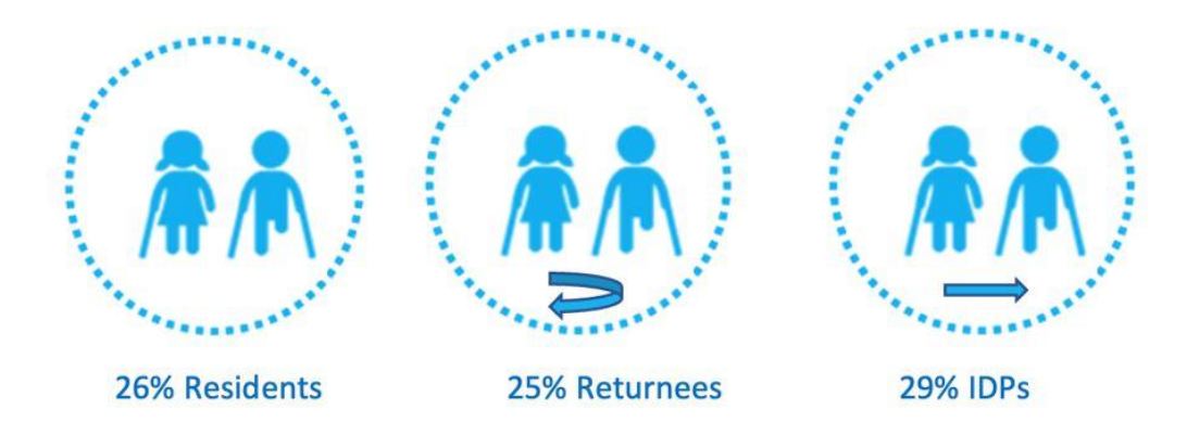
Figure 2. Disability Prevalence by population group<sup>11</sup>

The geographical variation is even greater amongst populations of internally displaced people (IDP), with almost half of IDPs in the north-east (46 per cent) having a disability. The disability prevalence also varies between population group (see Figure 2 and Table 1).